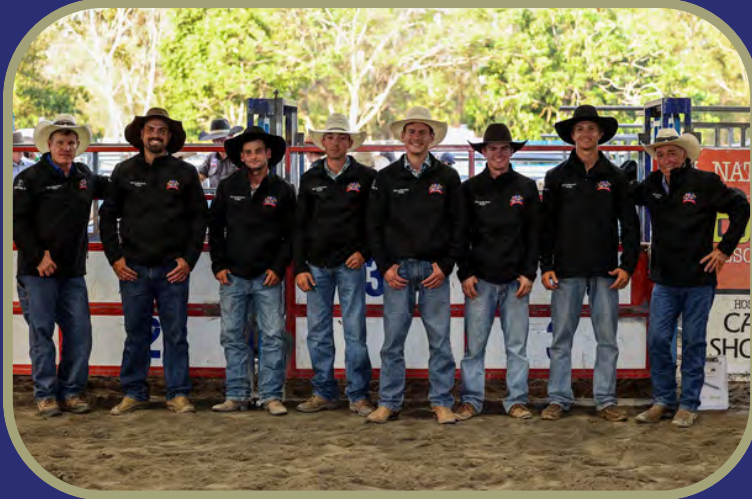
Saddle Ride finalists and Director proudly sporting their sponsored jackets