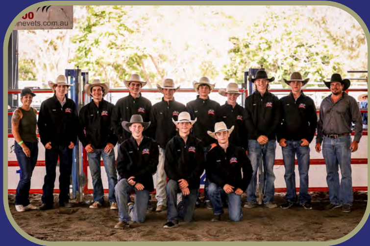
U18 Junior Bull Ride finalists proudly sporting their sponsored jackets