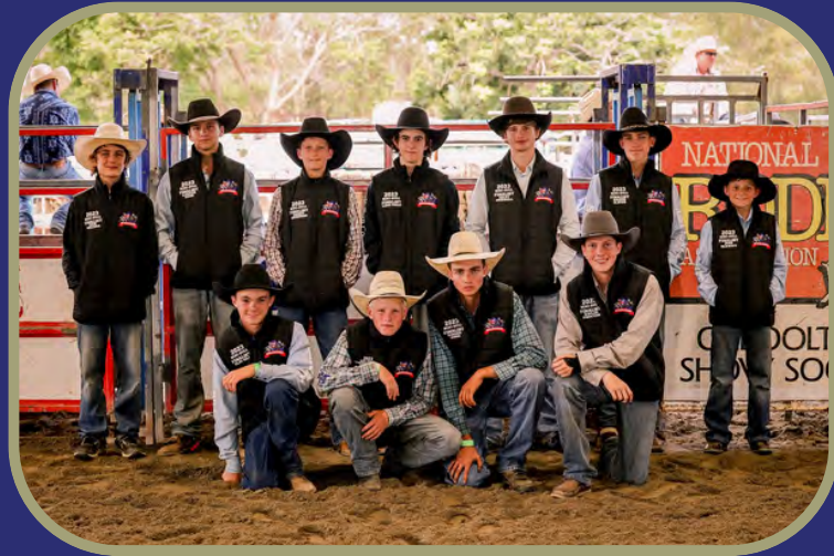
U15 Mini Bull Ride finalists proudly sporting their sponsored vests