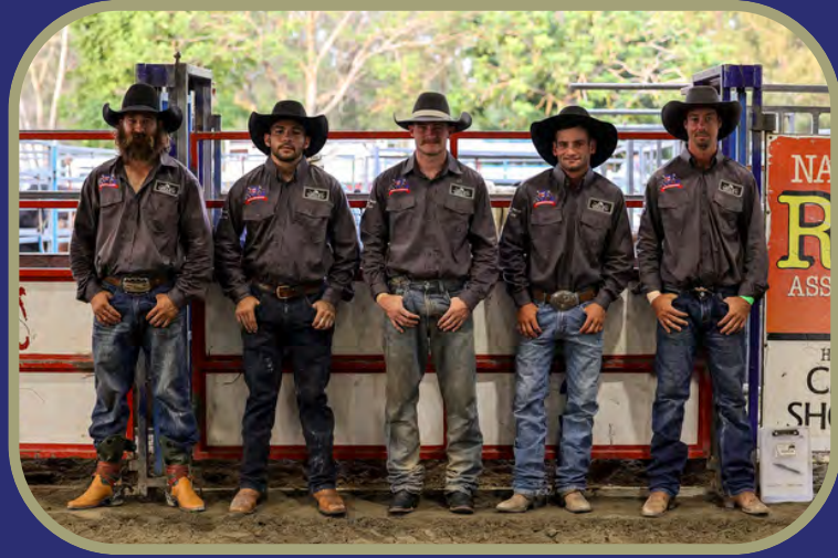
Bareback Ride finalists dressed in their sponsored shirts