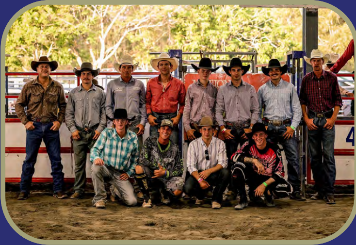
Bull Ride finalists and round 3 Bull Fighters