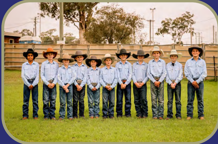
U12 Mini Bull Ride finalists proudly dressed in their sponsored shirts and vests