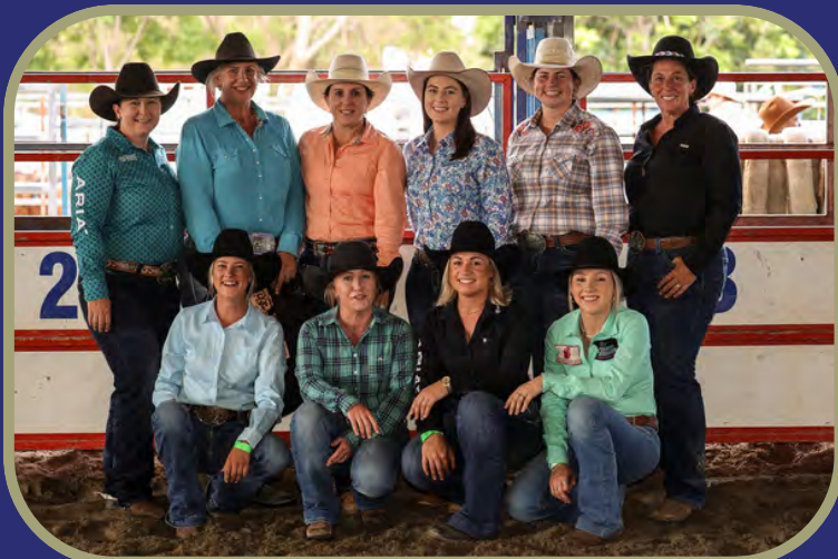
Breakaway Roping finalists