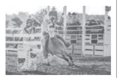
Ellie Granger – Barrel Race – Tenterfield Finals