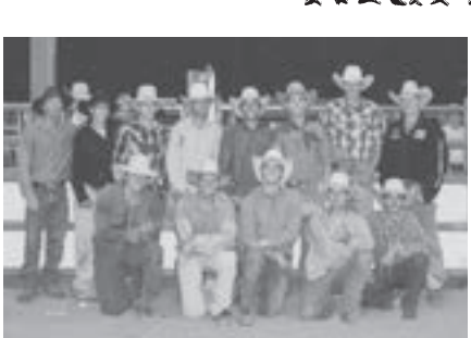
Bull Riding Finalists