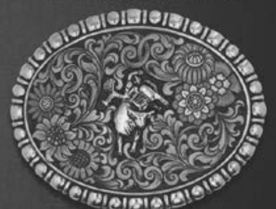
$249-AUD LIMITED EDITION of 300