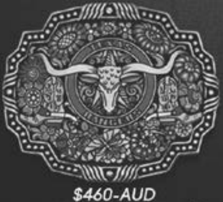
LIMITED EDITION of 50