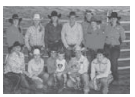
Breakaway Roping Finalists