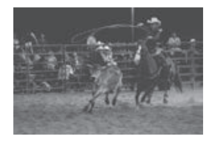
Cheyenne Whitwell – Breakaway Roping – Caboolture Finals