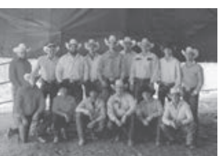
Team Roping Finalists