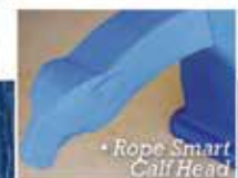
• Rope Smart Calf Head