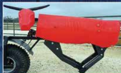
• Time Machine