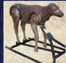
• Tuf Kaf