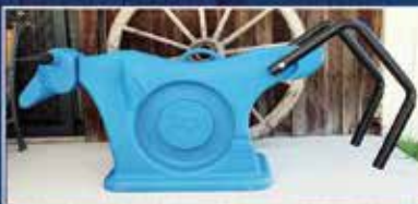
• Rope Smart