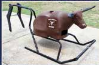
• Rope right sled (bones not included)