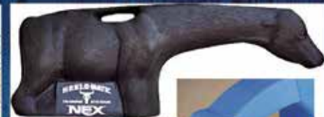
• Nex Calf