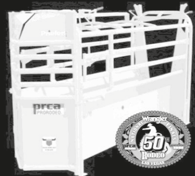
The official chute of the Wrangler NFR.

Endorsed by the PRCA, Priefert's competition roping chute is a full 18" longer than our standard models to meet PRCA requirements. This chute features all the great features of our RC98 series and also features a neck access panel near the front of the chute.