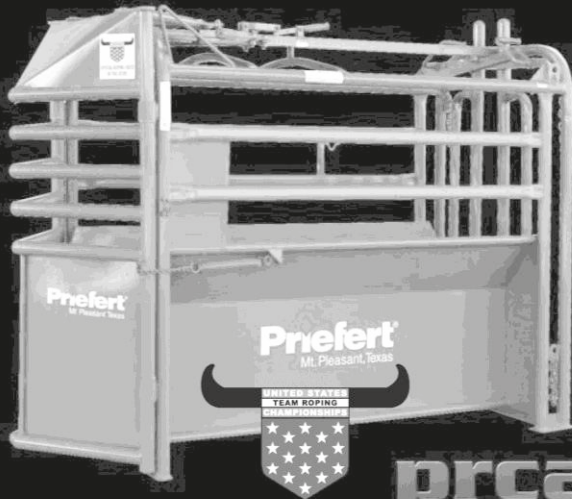
The official chute of the USTRC &