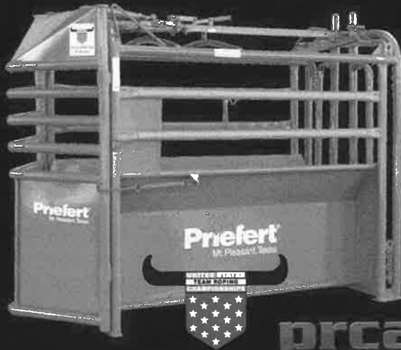
The official chute of the USTRC &