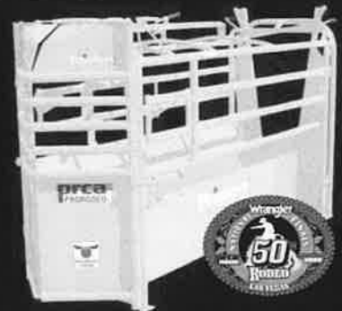
The official chute of the Wrangler NFR.

Endorsed by the PRCA, Priefert's competition roping chute is a full 18" longer than our standard models to meet PRCA requirements. This chute features all the great features of our RC98 series and also features a neck access panel near the front of the chute.