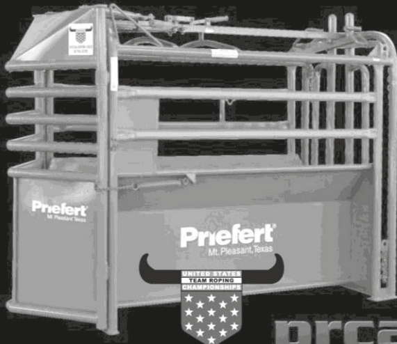
The official chute of the USTRC &