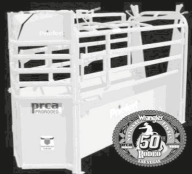
The official chute of the Wrangler NFR.

Endorsed by the PRCA, Priefert's competition roping chute is a full 18" longer than our standard models to meet PRCA requirements. This chute features all the great features of our RC98 series and also features a neck access panel near the front of the chute.