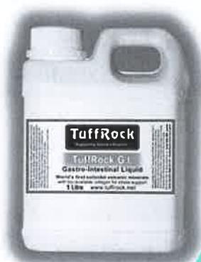
TuffRock G.I. Gastro-Intestinal stress support.

World's first energised three and two dimensional volcanic minerals, bio-available for collagen, joint and stress support