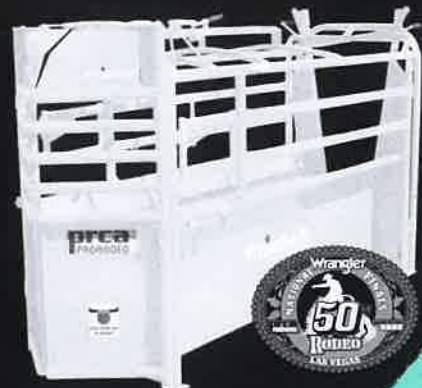
The official chute of the Wrangler NFR.

Endorsed by the PRCA, Priefert's competition roping chute is a full 18" longer than our standard models to meet PRCA requirements. This chute features all the great features of our RC98 series and also features a neck access panel near the front of the chute.