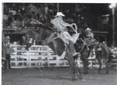
N.R.A ASSOCIATE MEMBER 2451

To be part of this great event contact, the Warwick Rodeo office on (07) 4661 9060 or email: info@warwickrodeo.com.au Entries close on Friday 5 th October 2012. Check out all the action this year on facebook.