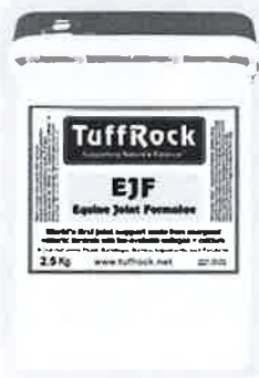
TuffRock E.J.F. Equine Joint Formulae Show freedom of movement.