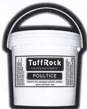
TuffRock Poulitice Show Tack must have.