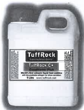
TuffRock Conditioner Plus Show Condition from the inside out.