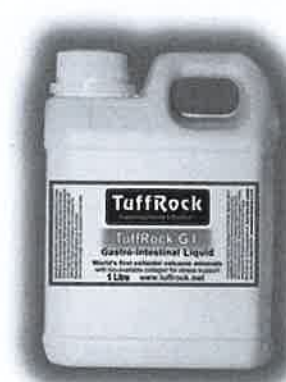
TuffRock G.I. Gastro-Intestinal stress support.

World's first energised three and two dimensional volcanic minerals bio-available for collagen, joint and stress support