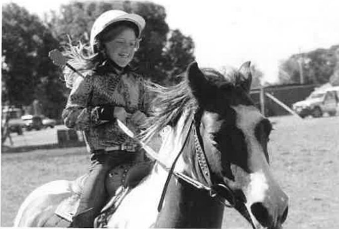
Kingaroy Junior - Trinity Emes Barrel Race