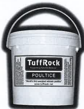
TuffRock Poulitice Show Tack must have.