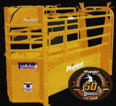
The official chute of the Wrangler NFR.

Endorsed by the PRCA, Priefert's competition roping chute is a full 18" longer than our standard models to meet PRCA requirements. This chute features all the great features of our RC98 series and also features a neck access panel near the front of the chute.