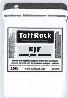
TuffRock EJP Equine Joint Formulae Show freedom of movement.