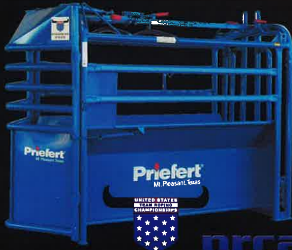
The official chute of the USTRC &