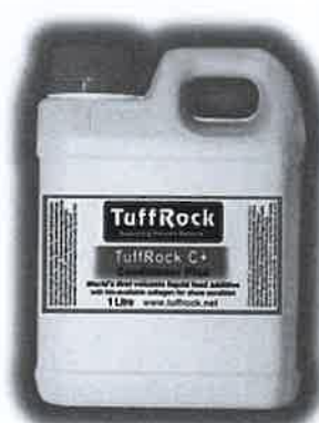
TuffRock Conditioner Plus Show Condition for the inside out.