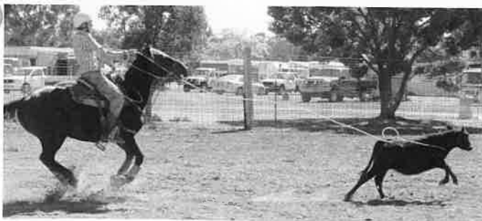
Kingaroy Junior - Taylor Schultz Breakaway Roping