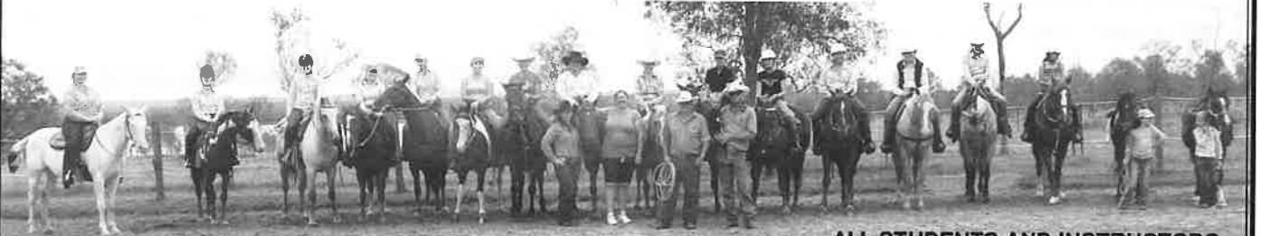
ALL STUDENTS AND INSTRUCTORS.

Email: clintdawnemes@hotmail.com or Phone: 0447 814 030