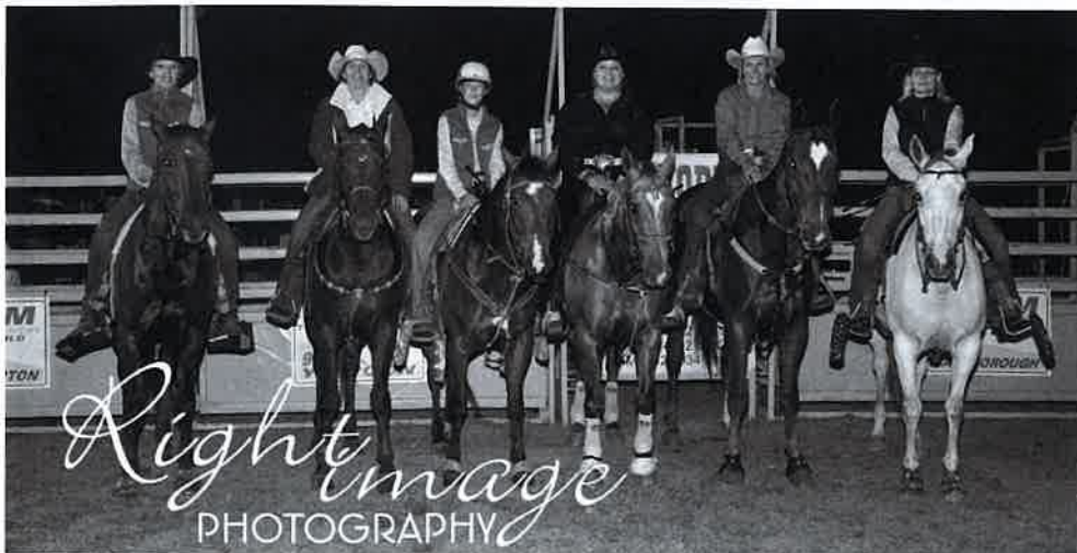
The N.R.A. Barrel Racing Team at Bundaberg Circuit Challenge 2011.