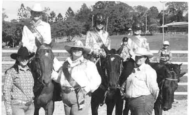
Dayboro Quest Winners

Email: clintdawnemes@hotmail.com or Phone: 0447 814 030