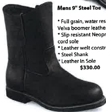
Mens 9" Steel Toe