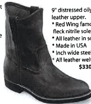
Mens 9" Roper Boot