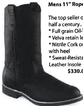
Mens 11" Roper Boot