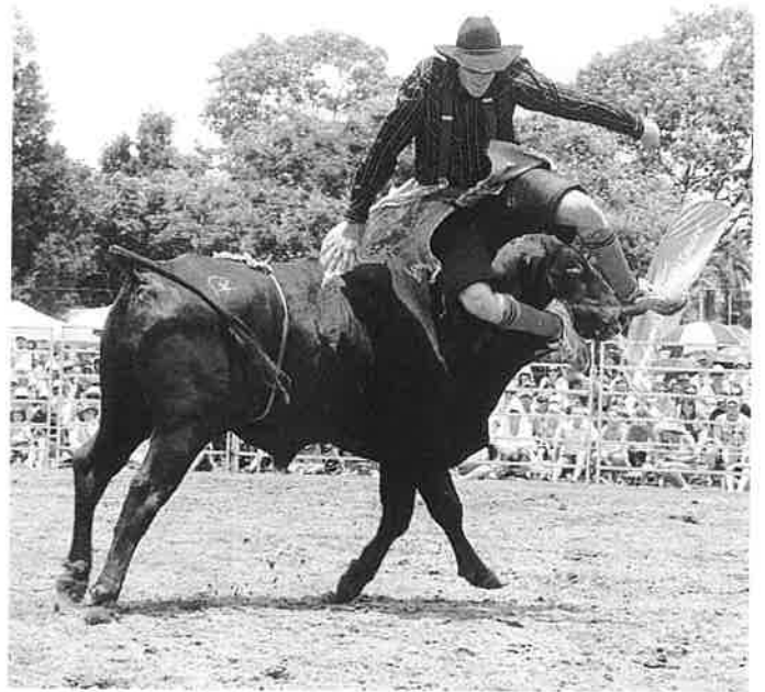
Gold Coast Rodeo.