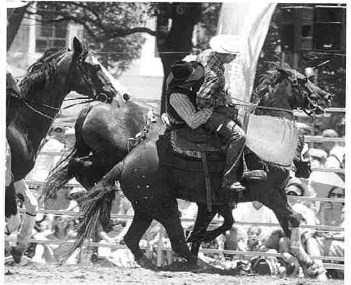
Gold Coast Rodeo.