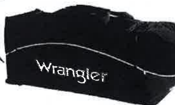
Wrangler Logo Gearbag $49.95