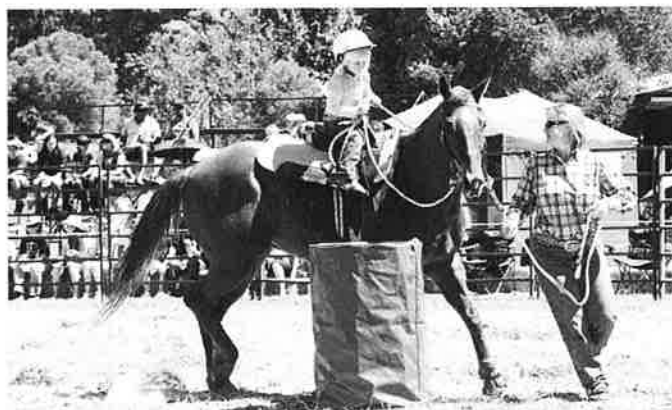
"Tyalgum Rodeo"

Sponsors for 5 Junior Final events & Junior Rodeo (Saturday morning) Ph Debbi 0488-452057 or Dawn 0447-814030