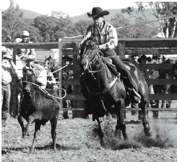
Christine Bushell