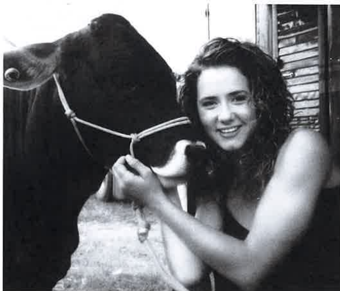
Shea & Pod at the Caboolture Finals 2006