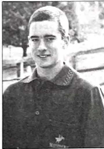
New Maverick Polo Shirts in stock