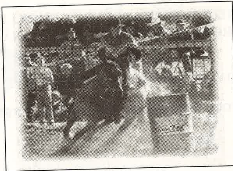
"Eyes of Texas"