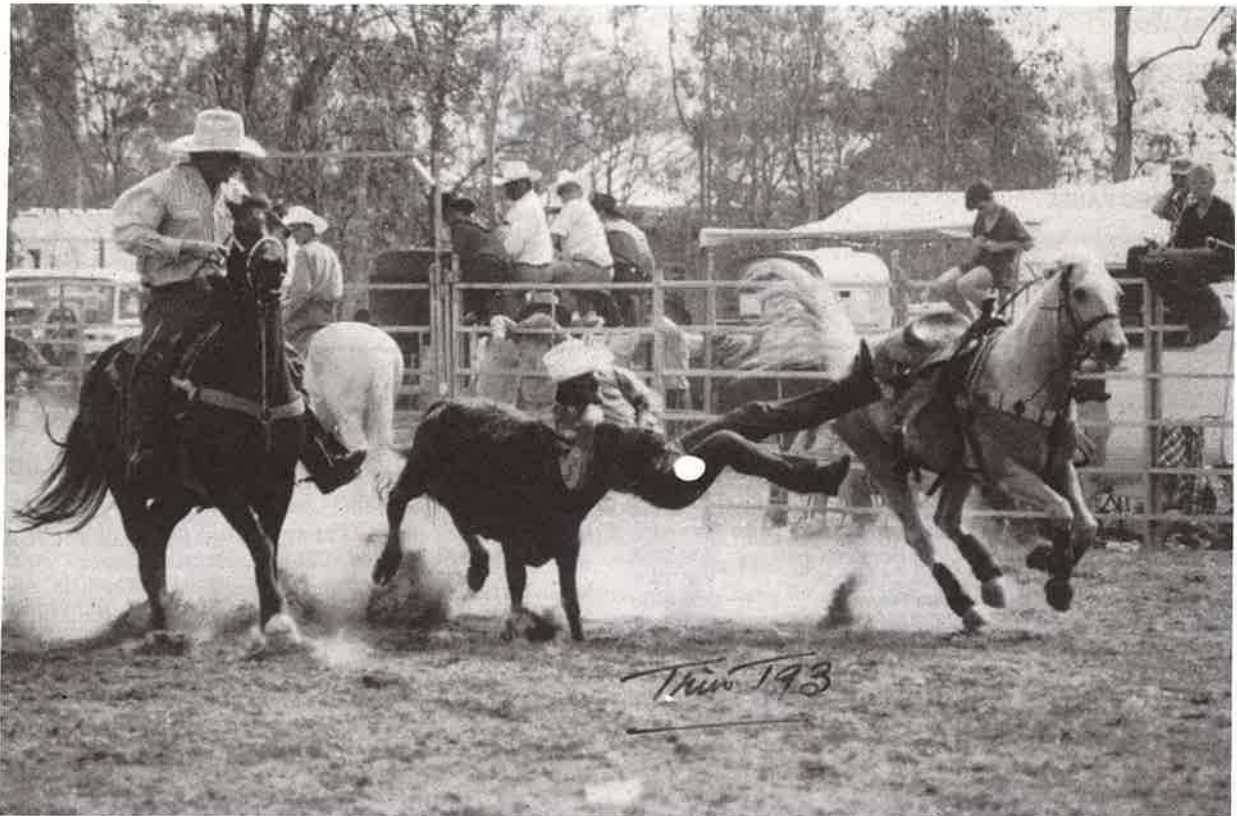
1993 Steer Wrestling Champion showing his style at Coominya '93.