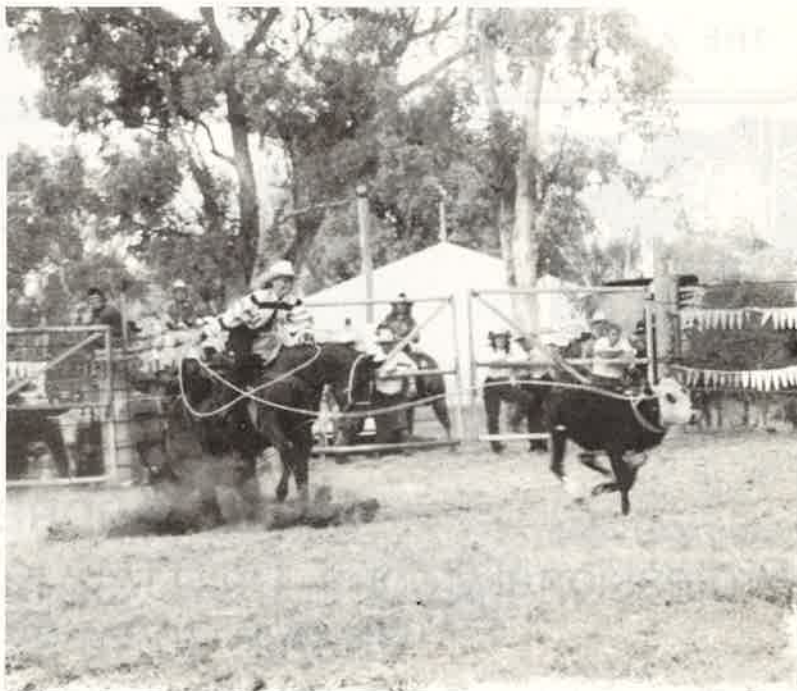
Ann Weiden picking up money at Stanthorpe.