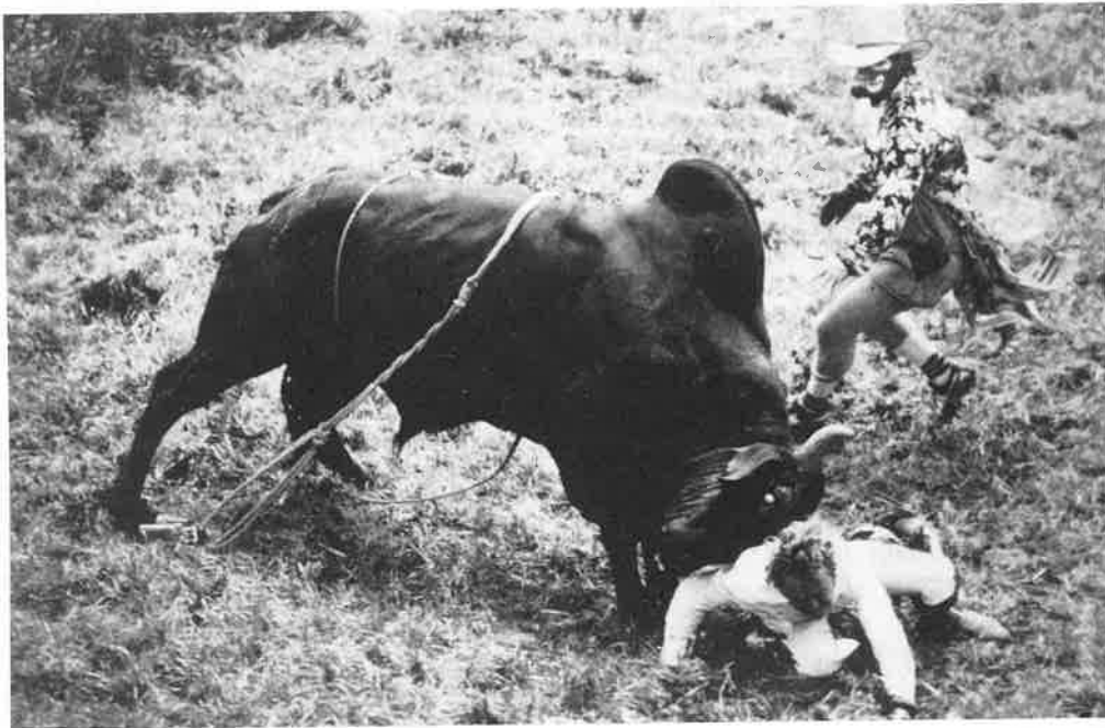
Chicken Wales showing the wild side, sitting uncomfortably on the ground. Do you remember this Chicken?