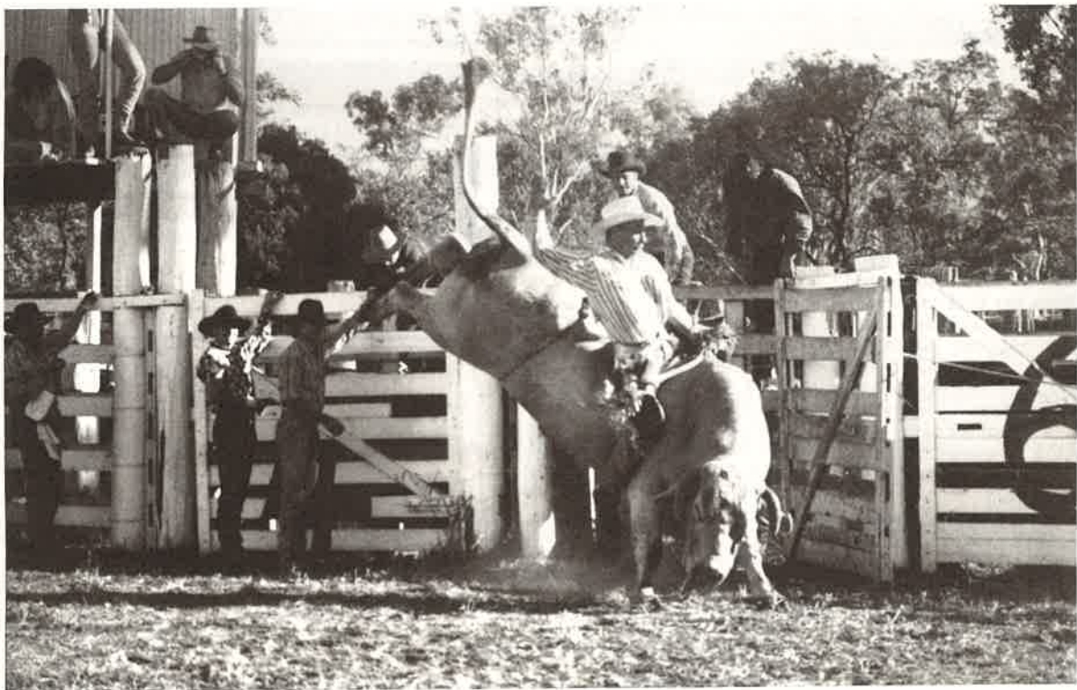
Top shots by Steven R great Bucking Bulls per (Pho