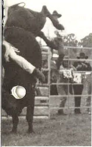
ing down on that set of racks ulls at Toowoomba Rodeo.