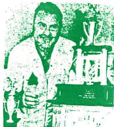
MR WHIP ICE CREAM VANS FOR ALL YOUR ICE CREAM NEEDS SEE MR WHIP AT MOST OF THE RODEO'S.